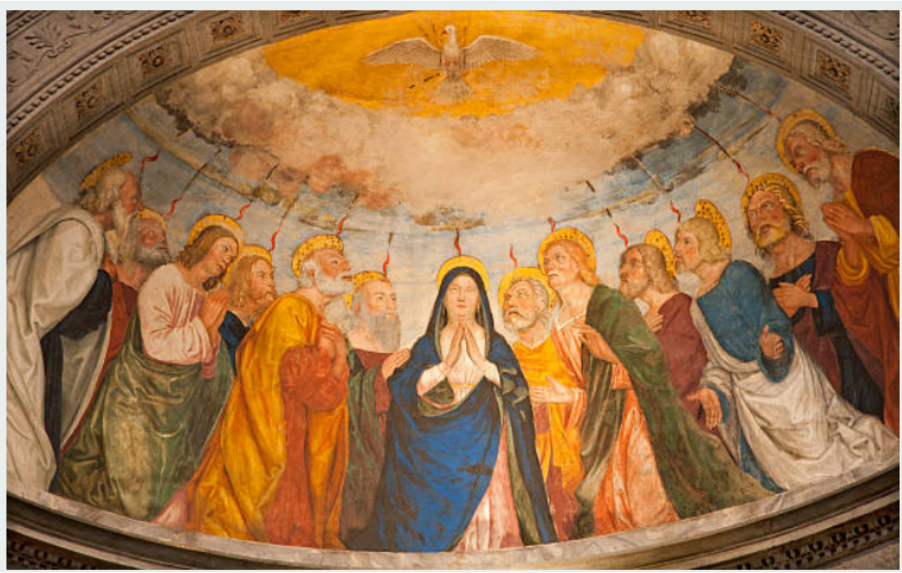
A painting of Pentecost in Saint Anastasia church in Verona, Italy. Apse of Chapel Miniscalchi in Saint Anastasia's church from 1506, designed by Angelo di Giovanni.